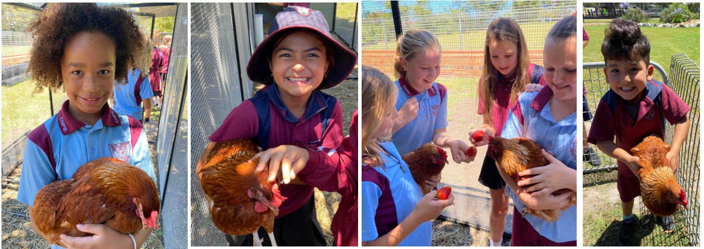
Our chickens have certainly been feeling the love