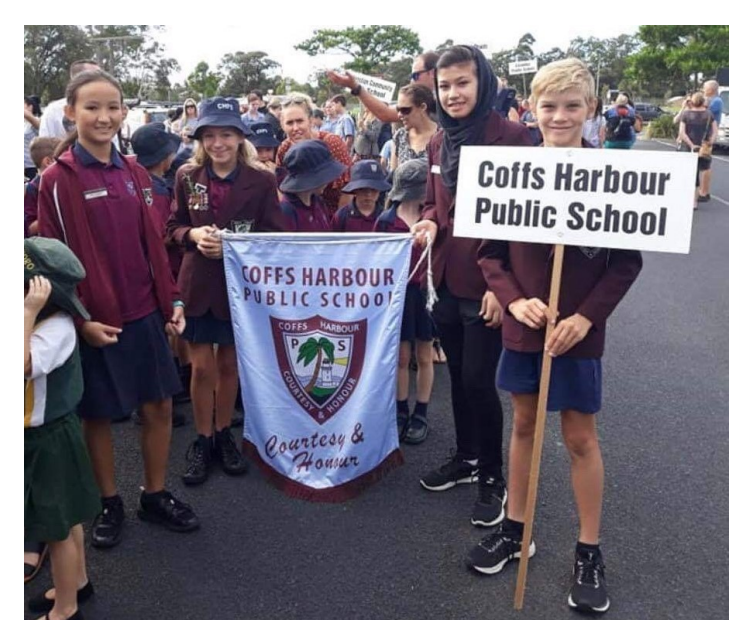
ANZAC Day 2019

Break times are 11-11.45 am and 1.15 -1.45pm.