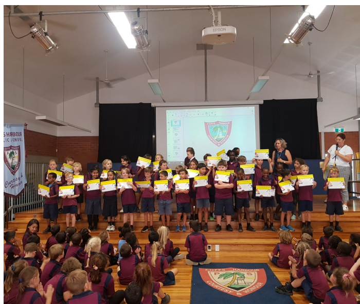
Year 2 swimming awards

Thinking of applying for a government selective high school for Year 7 in 2021?