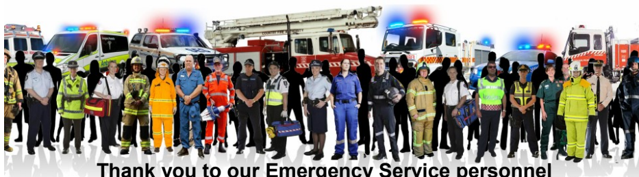
Thank you to our Emergency Service personnel