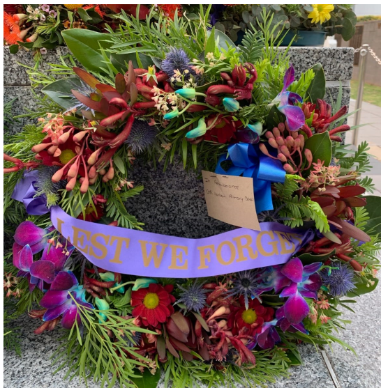
Remembrance Day Wreath