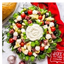
12 Salads of Christmas