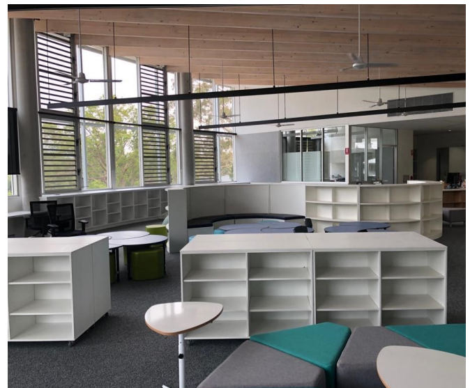
The Library is looking great