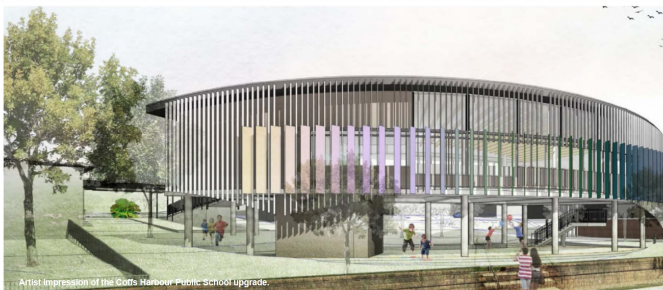
Artist impression of the Coffs Harbour Public School upgrade.