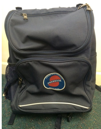
New School Bag